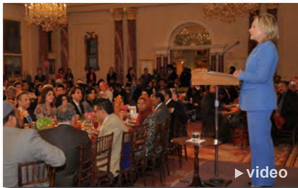
Secretary Clinton introduces “Generation Change” at the State Department’s iftar.

Find out more about the Office of the Special Representative to Muslim Communities: