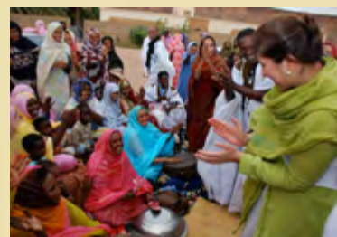
Special Representative Pandith discusses Muslim Engagement on Freedom Radio in Nigeria in October 2009 and visits youth groups in Chinguetti in April 2010.