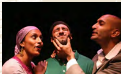
Wajahat Ali's play, “The Domestic Crusaders:”