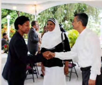
U.S. Ambassador's iftar in Port of Spain.

In Jerusalem, the American House organized an iftar and a party for over 100 children. The evening included a Ramadan sing-along; a puppet show; and balloons and school gifts for the children.