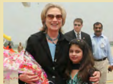
A young girl attired in Pakistani national dress presents a bouquet to Secretary Clinton upon her arrival in Islamabad for a Town Hall Meeting July 19, 2010.