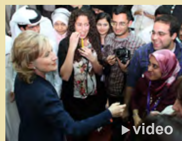
Secretary Clinton’s Town Interview Hosted by Al Jazeera at Carnegie Mellon University Qatar Campus in Education City, February 15, 2010.

In this issue, we highlight one of the many youth initiatives launched by Secretary Clinton in 2010: “Generation Change.”